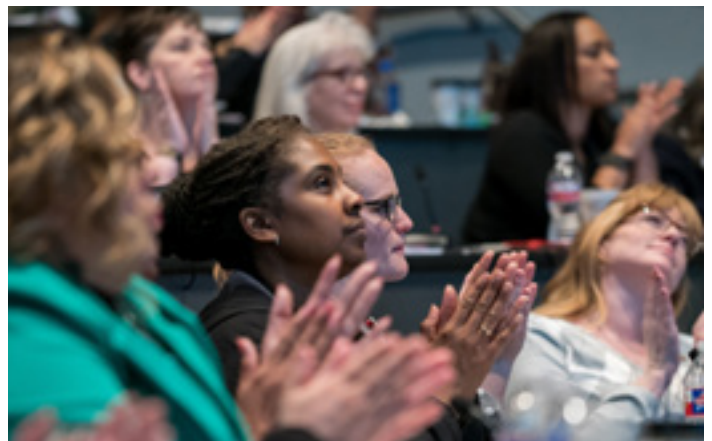
North Texas Transitional Care Conference 2017