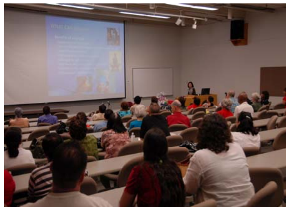
NorTex Convocation of Practices Dissemination Presentation

We hope to make this an annual event to give back to our researchers and community. Overall, the day was a success, and we look forward to working with you on the second annual NorTex Convocation of Practices in 2010.