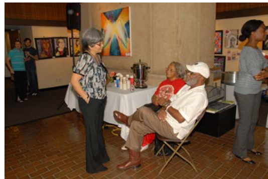
NorTex Convocation of Practices Participant Reception