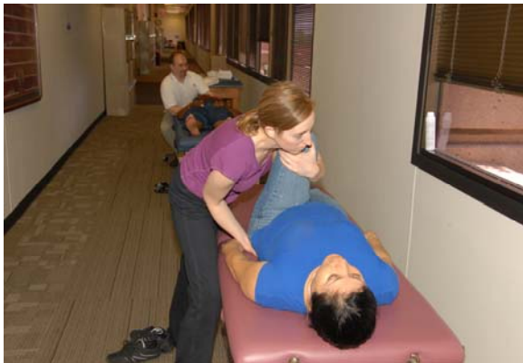
NorTex Convocation of Practices Mini Health Fair

A list of the panel discussions and presentations with presenters is given below. The day closed with a Conversation Café during which NorTex members were asked what challenges they face in providing the best care possible to their patients. We received excellent feedback that will provide guidance in the future direction of NorTex projects.