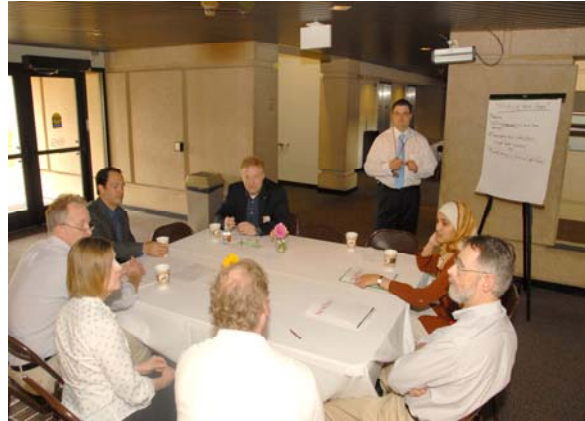
NorTex Convocation of Practices Conversation Café Roundtable Discussion

weight, body fat, osteoporosis, and glucose. Safe Kids of Tarrant County provided information on preventing poisonings among kids. Additionally, osteopathic manipulative services were provided.